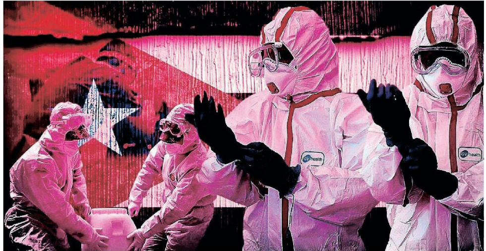
THERE were no specifics on what the Cubans were coming to South Africa for, except that they were either trained doctors, public health practitioners or epidemiologists, says the writer.